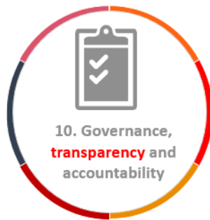
*NESG Tax Perception Survey